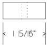
Detail of Insert