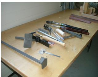
Equipment used for sharpening tools.