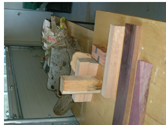
Raffle Draw Table