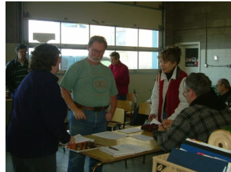
Discussions after Viewing video