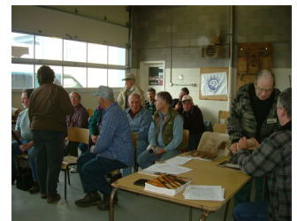
Viewing of Video