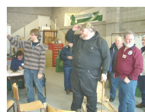
Discussion groups at meeting