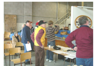
Viewing Show & Tell projects