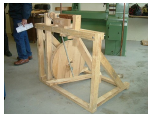
Hand made lathe