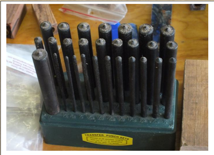
Transfer punch set.