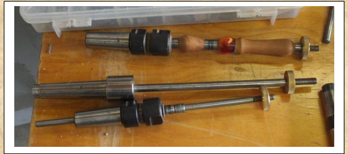
Some of Dave's less than essential tools.