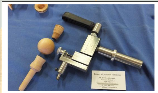
<<< The ball radius cutting jig. www.threadingjig.com