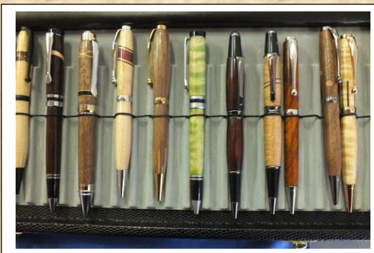
Closer views of Ray's pen collection.