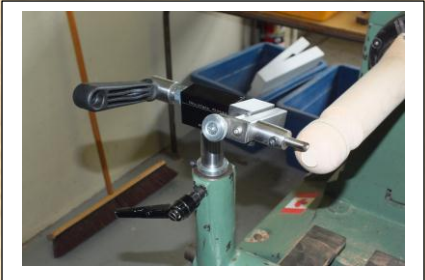
Ball jig on the lathe.