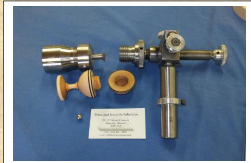
Easy threading jig tool, with Peter's example piece. www.threadingjig.com