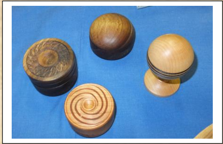
Peter's box top patterns.