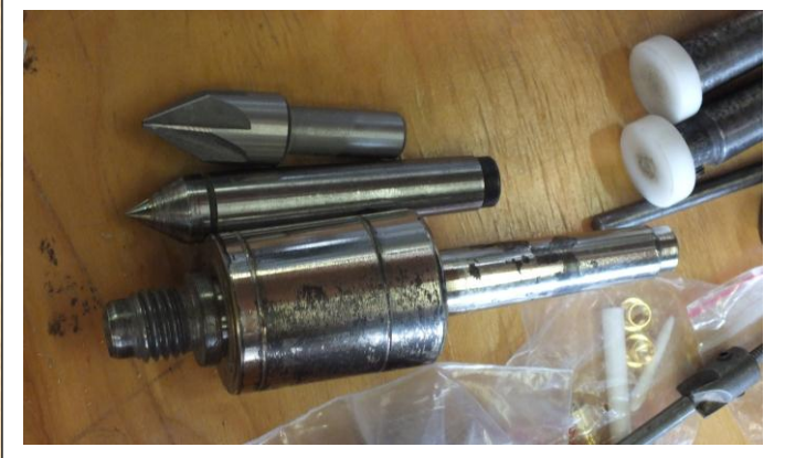
Some of Dave's essential tool arsenal.