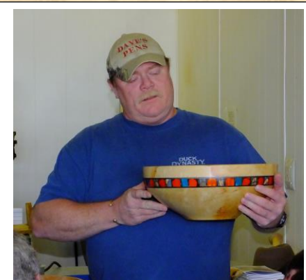
Bowl with an inlay of old pen blanks around the edge.