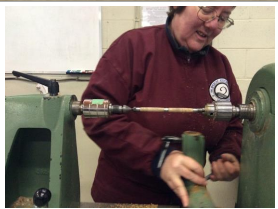
Almost completed pen ready for sanding and finishing