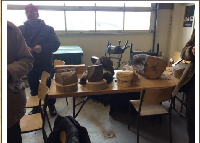
What a wonderful collection of goodies