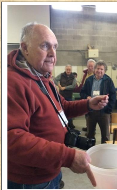
And the winner is