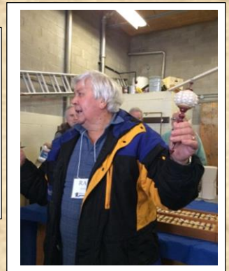
From Carl Durance