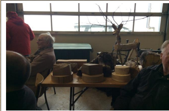
Mike the reindeer and other choices.