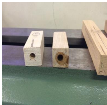
Pen blanks being prepared for turning. Hole drilled and then metal tube glued in place