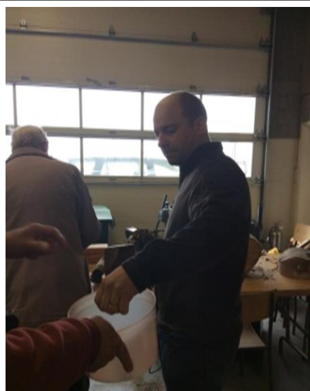
Pick me Pick me