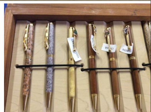
Some samples of Peggy's turned pens