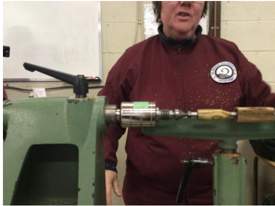
First part of the pen being turned