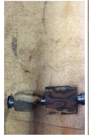
Partially turned pen