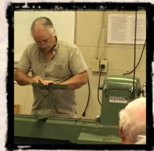
Smoothing Tool Rest