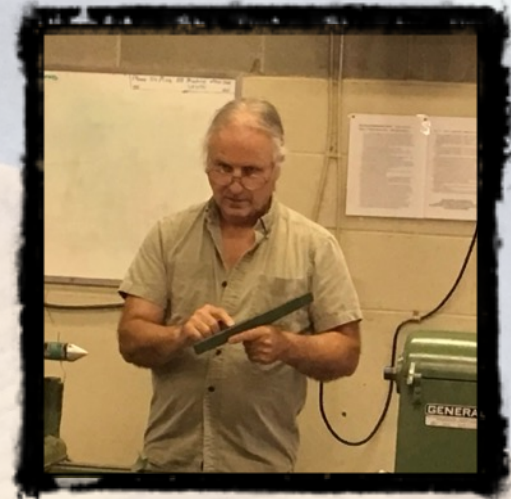
Checking for nicks in tool rests

Carl's Demo on maintenance of your lathe and its accessories