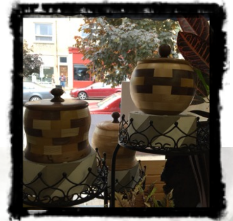
Bravery Beads Boxes