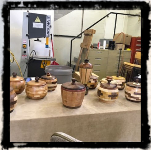
Examples of Bravery Bead Boxes