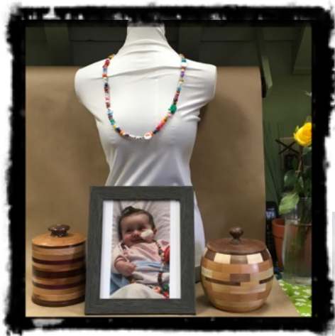
One of the tiny recipients