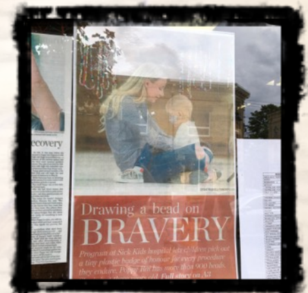
Newspaper Article about the program