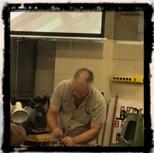
Cleaning and lubricating chucks