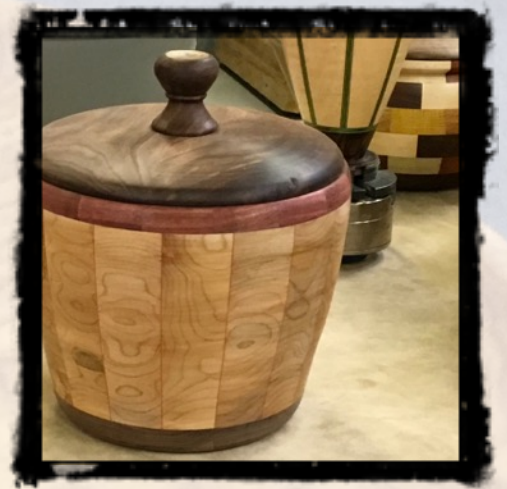
Close up of Bravery Bead Box