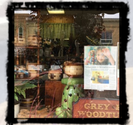
Display from the outside looking in