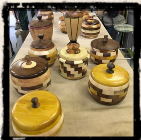
Guild Bravery Bead Boxes