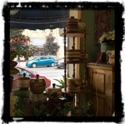
Display from the inside looking out