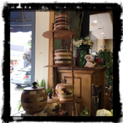
Display slightly different angle