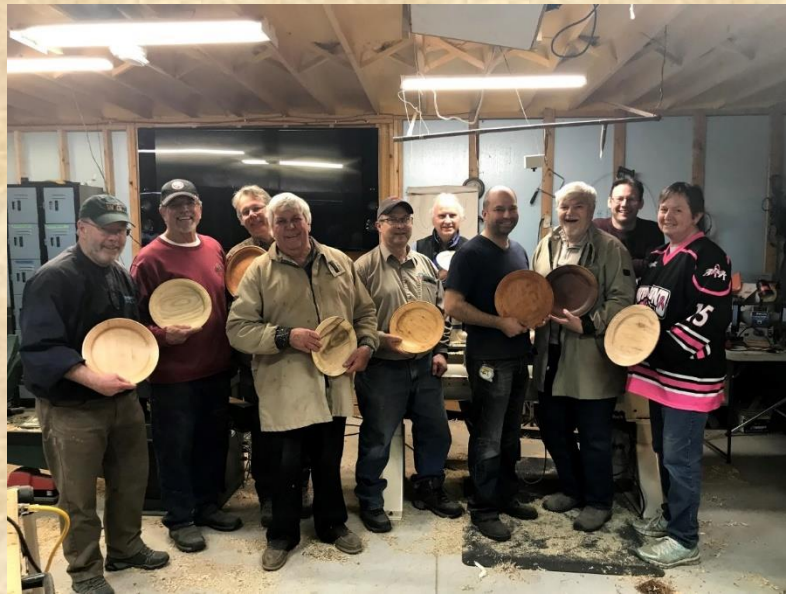
What a great group of turners!