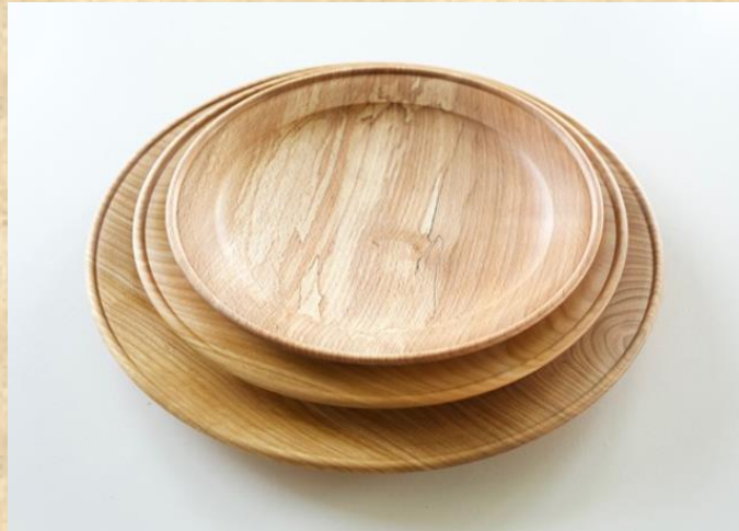
Examples of the Irish platters